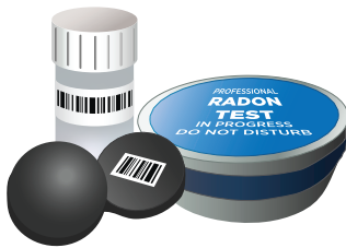
Radon test kits